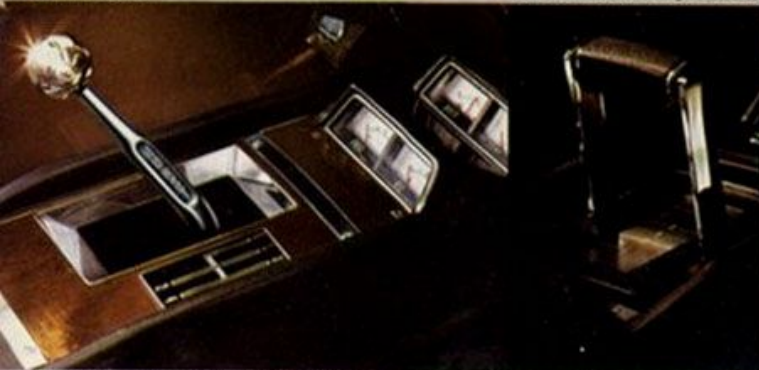
4-Speed transmission with a Hurst shifter and Special Instrumentation on console.