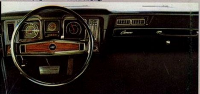
Powerglide with console.