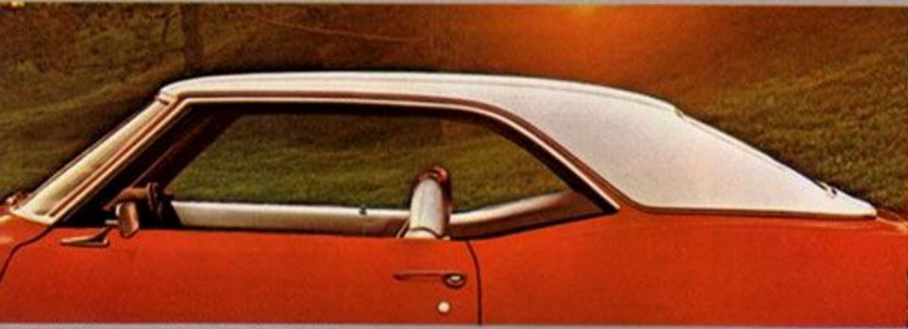
Vinyl roof cover with a new styling touch.