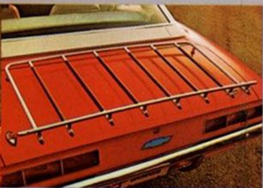
Rear deck luggage rack.