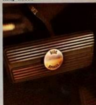
Power disc brakes.