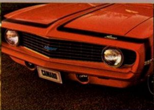
Color-Matched bumper and front accent striping.